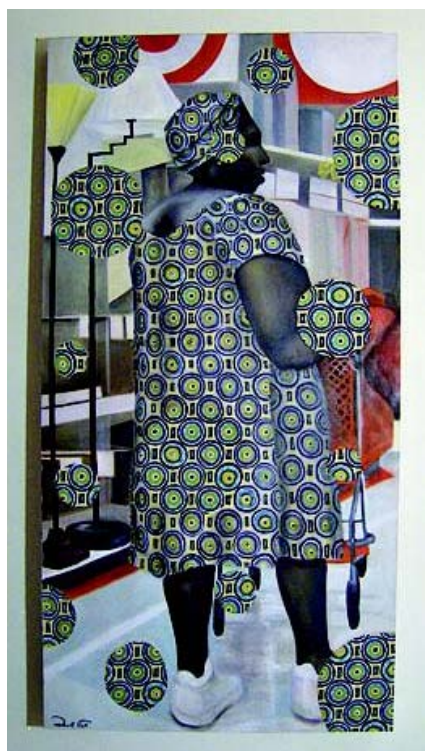
courtesy Festa sometimes takes candid photos of people that she turns into paintings. This painting called 'Target,' done with oil paints on fabric, comes from a photo of woman shopping.